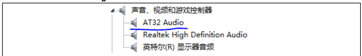
Figure 3. Device enumeration on PC side